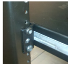
Figure 1b: Rack installation

See Figure 2a and Figure 2b for an illustration of the mounting hardware configured for a cabinet installation.